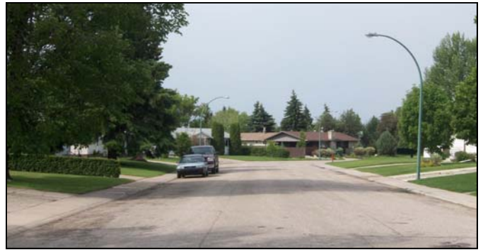
Inviting pedestrian pathway

categories for the purposes of controlling land uses and protecting property values. This Bylaw also marked the beginning of a street classification system that separated volumes of traffic into classes (local, collector, and arterial). Neighbourhoods developed under the First Zoning Bylaw include early forms of curvilinear streets, where grid patterns give way to crescents linked by a collector street. Indeed, the streets in Massey Place are an early form of the crescent design.