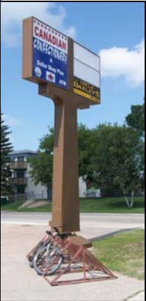
Strip Mall services

Massey Place's destination ratings suggest that there are few destinations of a moderate variety. For example, observed destinations in Massey Place include a convenience store, a gas station, two schools, a park, a restaurant and pub, and a strip mall with some services.