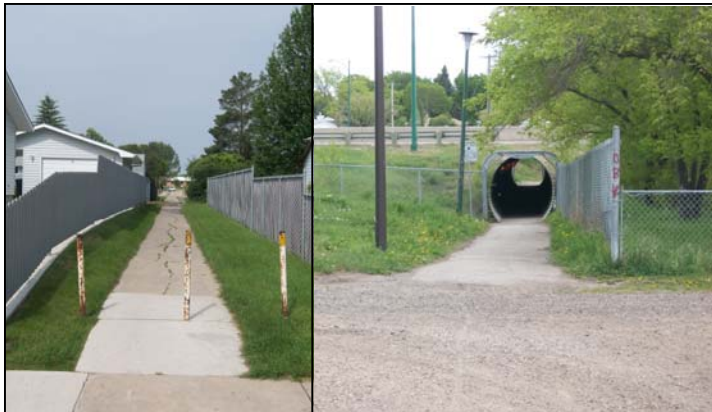
Pedestrian access ways

Further, wide streets provide adequate room for cyclists and bike parking located at some destinations increases bike friendliness. However, the street pattern can be confusing and difficult to navigate. Pedestrian access ways located in some areas of the neighbourhood provide additional connection where streets are otherwise disconnected.