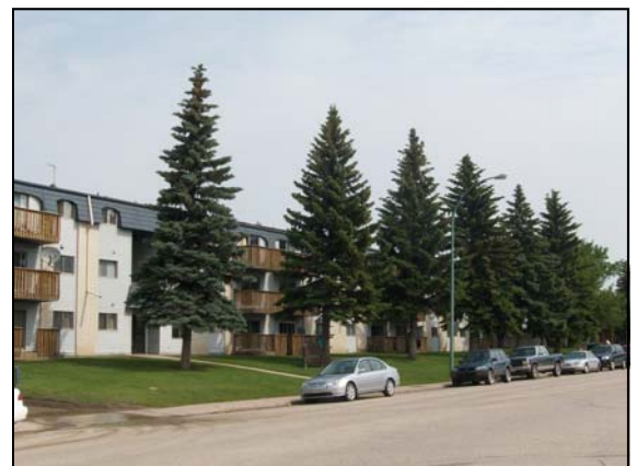
Trees obstruct the view and limit the opportunity for passive surveillance of the street

Massey Place's safety ratings suggest that pedestrian and vehicular travel areas are fairly well defined and safe to navigate and that there are only a few elements that reduce feelings of personal security. For example, very few areas were marked for pedestrian crossing. Our observers felt some of the busier streets were unsafe to cross without such assistance. In terms of safety from crime, a low amount of graffiti and plenty of opportunities for casual surveillance of the street by home owners contribute to the perception of personal security. However, we observed some poorly maintained homes and some spaces in alleyways or concealed by bushes that could be used for lurking.