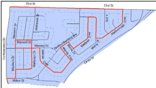
NALP Route Map

To determine which Saskatoon neighbourhood designs are the most supportive of active living, researchers walked each neighbourhood in Saskatoon in the summer months of 2009/2010, collecting data on these areas using two research surveys: the Neighbourhood Active Living Potential (NALP) and the Irvine-Minnesota Inventory (IMI).