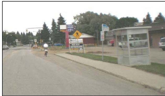
Wide streets provide room for cyclists

We rated the activity friendliness of each neighbourhood based on specific features that encourage or present barriers to an active lifestyle. These ratings suggest whether a neighbourhood assists or limits the opportunities for physical activities such as walking, cycling, or skateboarding.