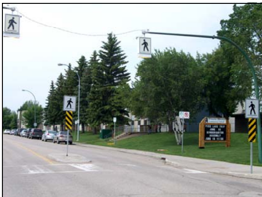
Well marked pedestrian crossing

We rated each neighbourhood according to the presence or absence of certain neighbourhood elements that increase or detract from a feeling of personal security. Observing both the physical and social characteristics of the neighbourhood, security was measured both in terms of traffic and crime. These ratings suggest whether safety concerns affect an individual's physical related active living decisions in their neighbourhood.