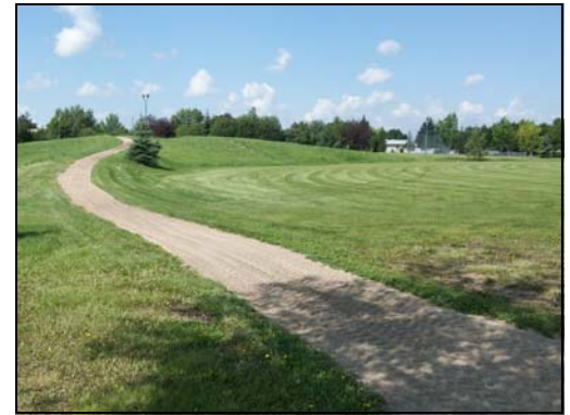
John A. MacDonald Park

Massey Place's attractiveness rating suggests that both attractive and unattractive features are present in the neighbourhood. For example, sidewalk amenities, such as benches and well-kept garbage cans, were absent from all observed streets. Street trees observed on some streets provide partial shade for some of the sidewalks. Further, some architectural variety and pleasant landscaping in some areas considerably increase the attractiveness of the neighbourhood.